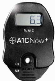
Figure 1. The improved A1cNow+ device. A fully integrated, disposable test cartridge device for quantification of HbA1c in capillary or venous blood.

POC HbA1c testing can improve diabetes management. An easier-to-use model of the A1cNow+ POC device (Bayer Healthcare, US) has been released. It is NGSP (National Glycohemoglobin Standardization Program) certified for the measurement of HbA1c levels and is CLIA (Clinical Laboratory Improvements Amendments) waived for home use.